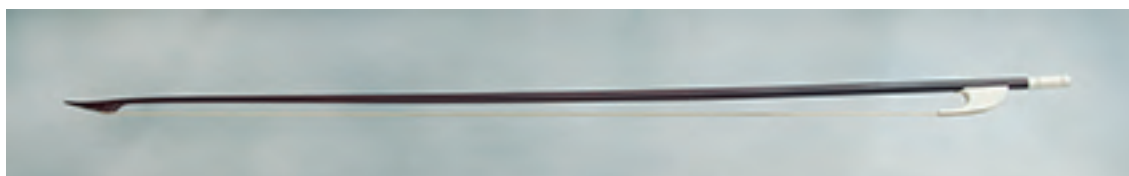
Treble Viol Bow

Length: 700 mm; weight: 50 - 54 gr; hair: 605 mm Snakewood stick. Frog and button in ivory (Mammoth)