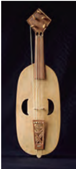
Vyola "Pórtico de la Gloria" (Cathedral of Santiago s. XII) String length: 320 mm 5 strings (1 drone) Price: 2.800 €