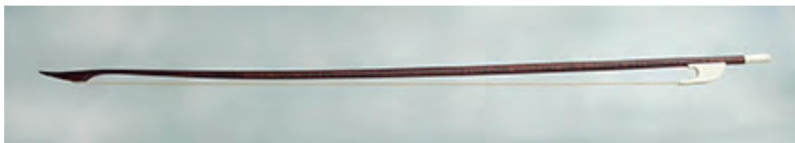
Bass Viol Bow

Length: 775 mm; weight: 90 - 94 gr; hair: 660 mm. Snakewood stick. Frog and button in ivory (Mammoth)