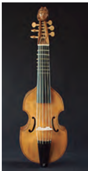
Pardessus de Viole After N. Bertrand (1753) 6 strings String length: 320 mm. Price: 3.000 €