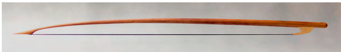
Bass viol bow

Approximate total length: 800 mm; weight: 78- 82 gr; hairs: 650 mm.