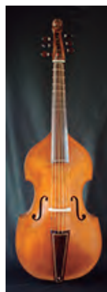
Bass Viola da Gamba. German After Jacob Stainer (private collection) 6 strings Soundboard in two carved pieces. String length: 710 mm. Price : 9.800 €