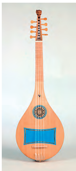
Mandora From iconography: Madonna of Humility (Fra Angelico 1433-1435) Four courses String length: 576 mm. Price: 2.500 €