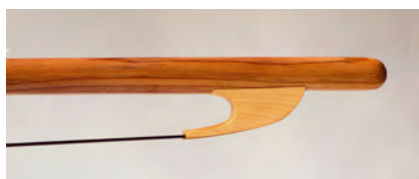
Frog tightening hairs