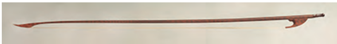
Treble Viol Bow

Length: 695 mm; weight: 48- 50 gr; hair: 600 mm. Stick, frog and button in snakewood