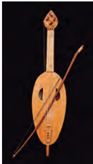
Large vyola Xelmirez Palace (s. XIII) Santiago de Compostela String length: 565 mm 4 strings (1 drone) Price: 3.500 €