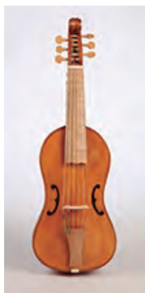
Treble Viola da Gamba After G. M. da Brescia (c. 1575) Six strings String length: 320 cm.