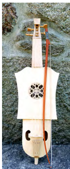
Violeta of Santa Catarina de Vigri (1433-1435) Four strings String length: 305 mm. Price: 3.000 €