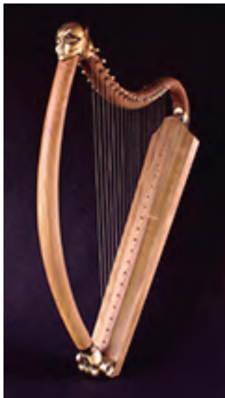
Harp Pórtico de la Gloria 19 strings. Tuning: G - d'' Price: 3.600 €