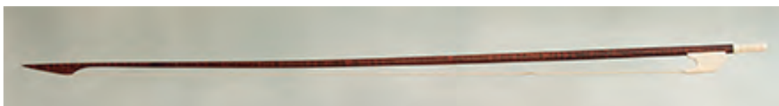
Bass Viol Bow

Length: 775 mm; weight: 95 - 98 gr; hair: 665 mm. Snakewood stick. Frog and button in ivory (Mammoth)