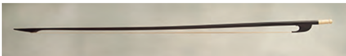
Bass Viol Bow

Length: 815 mm; weight: 97 - 100 gr; hair: 665 mm. Stick and frog in snakewood. Button in bone