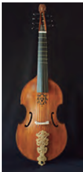
Bass Viola da Gamba. French After M. Colichon (end of 17th century) 7 strings Soundboard in five bent pieces. String length: 720 mm. Price: 9.500 €