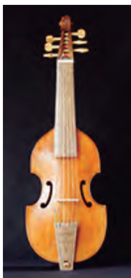
Treble Viol After H. Jaye 6 strings String length: 360 mm. Price: 3.500 €