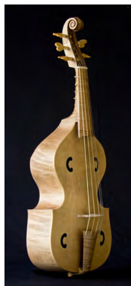
"Bowed vihuela" following the painting "The Harmony" or "The Three Graces" (Hans Baldung 1484/85-1545, Museo del Prado, Madrid). String length: 350 mm, five strings and five frets.