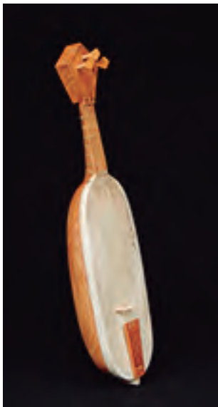
Lute Pórtico de la Gloria String length: 370 mm. 3 strings. Belly of parchment. Price: 2.500