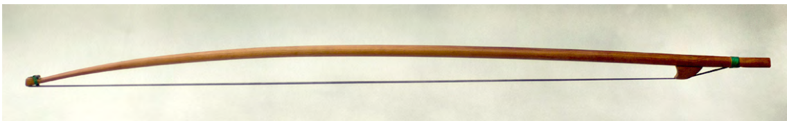
Treble viol bow

My Renaissance bows are the result of the study and development of various iconographic sources, mainly paintings of the fifteenth and sixteenth centuries. They are made with European woods. Black hairs. The hairs can be loosened with the clip-in frog.