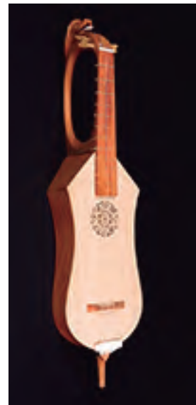
Citole Xelmirez Palace (s. XIII) Santiago de Compostela String length: 462 mm. Four strings. Price: 3.000 €