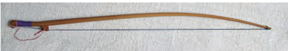
Vyola bow: length: 770 mm; weight: 50 - 60 gr.