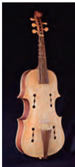
Violón Ibérico. Copy from the instrument in "Monasterio de la Encarnación" (Ávila), S. XVII (atrib. Domingo Pescador). 5 strings, 5 frets. String length: 705 mm. Price: 7.000 €