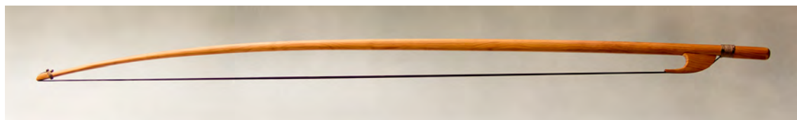
Tenor viol bow

Approximate total length: 780 mm; weight: 64 - 70 gr; hairs: 660 mm