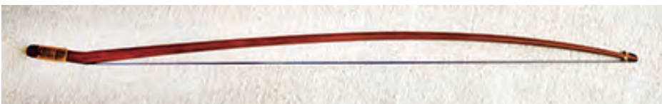
Large Vyola bow: length: 770 mm; weight: ± 84 gr.