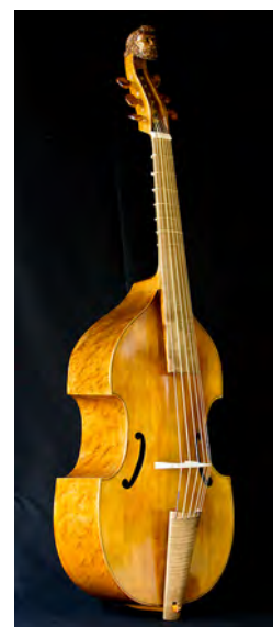
Viola da Gamba Tenor. After J. Rose 1598 6 strings String length: 580 mm. Price: 5.500 €